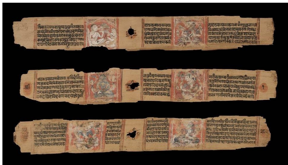
Figure 1.4 Palm leaf manuscript