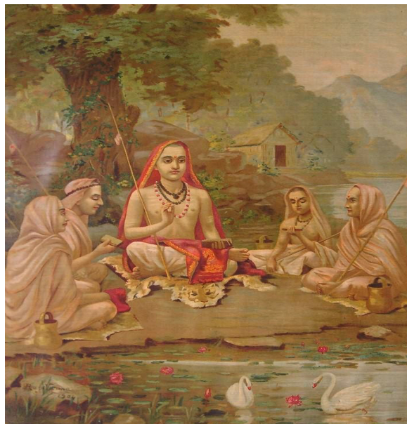
Figure 1.3 Guru Shishya tradition

Gurukulas or Ashrams were the houses of the guru or Acharya placed in natural surroundings and away from the noise of the residential areas. Parents sent their wards to these Ashrams at the age of five to nine years according to their caste. Pupils used to live, get educated and trained under the supervision and guidance of their gurus. Gurukuls were the residential schools and the student had to live there during the stay of his education. It embarked the Guru shishya tradition in education.