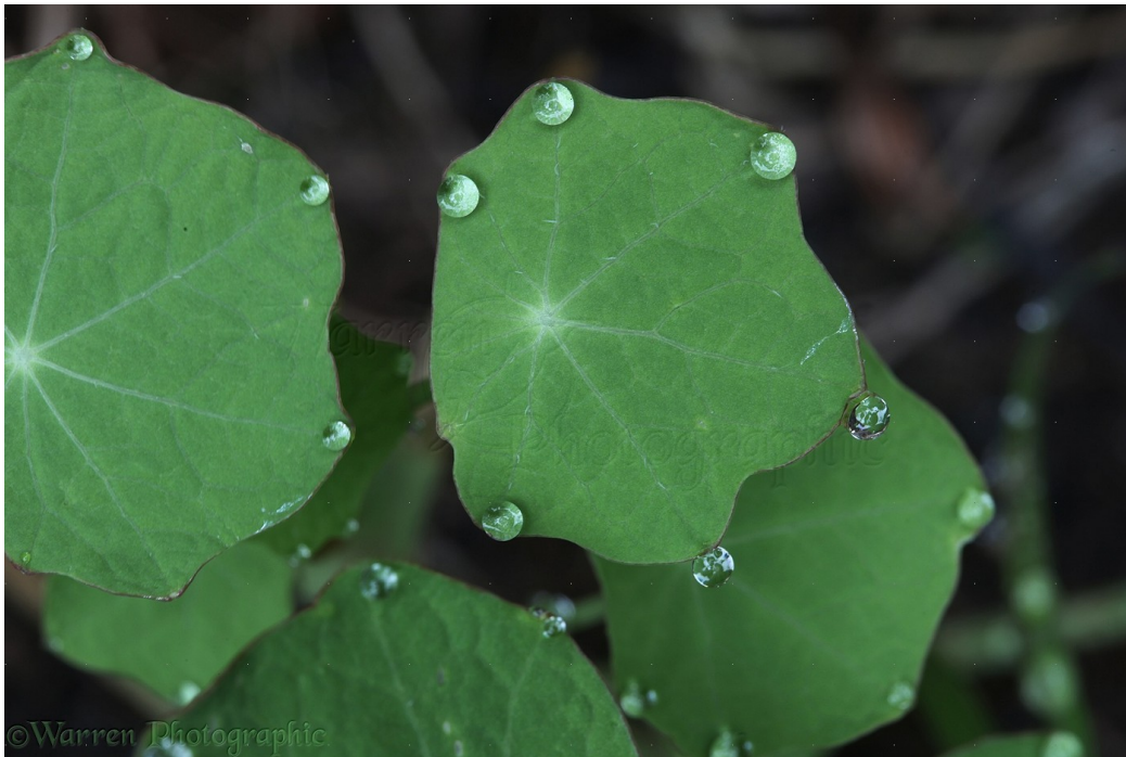
Image Guttation in leaves of Nasturtium

Plants that produce root pressure frequently produce liquid droplets of water on the edges of the leaves, at vein endings. The loss of water in the form of droplets through specialized structures called hydathodes is known as guttation .